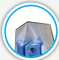
85° end for sanding corner apex