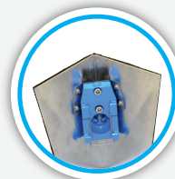
95° end for feathering outer edge