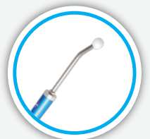
Fits Tapepro corner finisher handles

For more information contact Wallboard Tools: