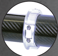
Adjustable control tube rollers

When purchasing the Tapepro SuperLite Auto Taper you not only obtain the most functional Auto Taper on the market but also the best presented tool for a professional plasterer's kit.