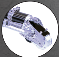
Titanium side plates