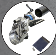
Quick release head