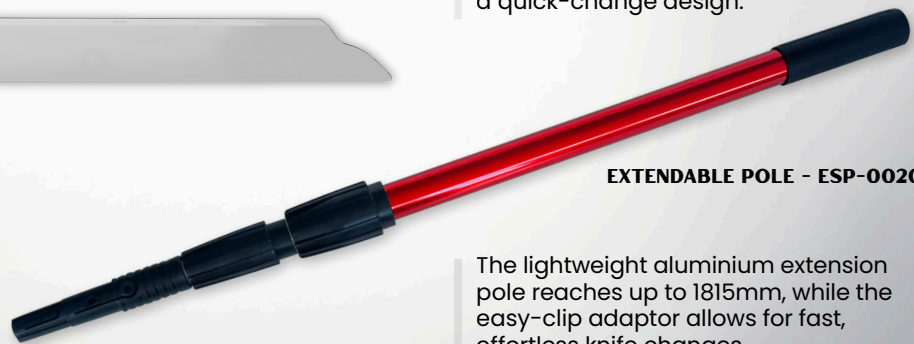
EXTENDABLE POLE - ESP-0020

The lightweight aluminium extension pole reaches up to 1815mm, while the easy-clip adaptor allows for fast, effortless knife changes.