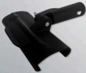
ADAPTOR - ESA-0010

The lightweight aluminium extension pole reaches up to 1815mm, while the easy-clip adaptor allows for fast, effortless knife changes.